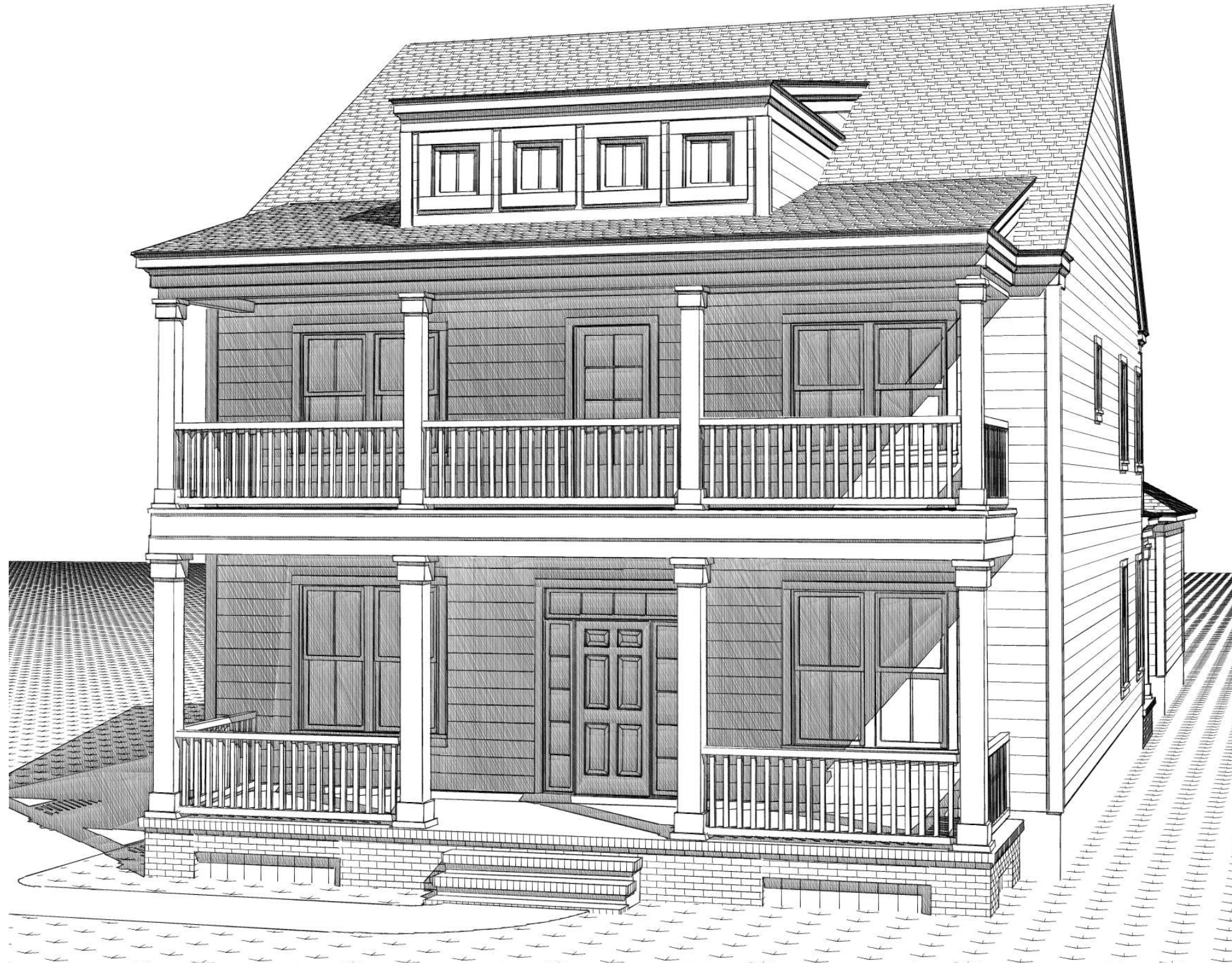
" REED CREEK COTTAGE "